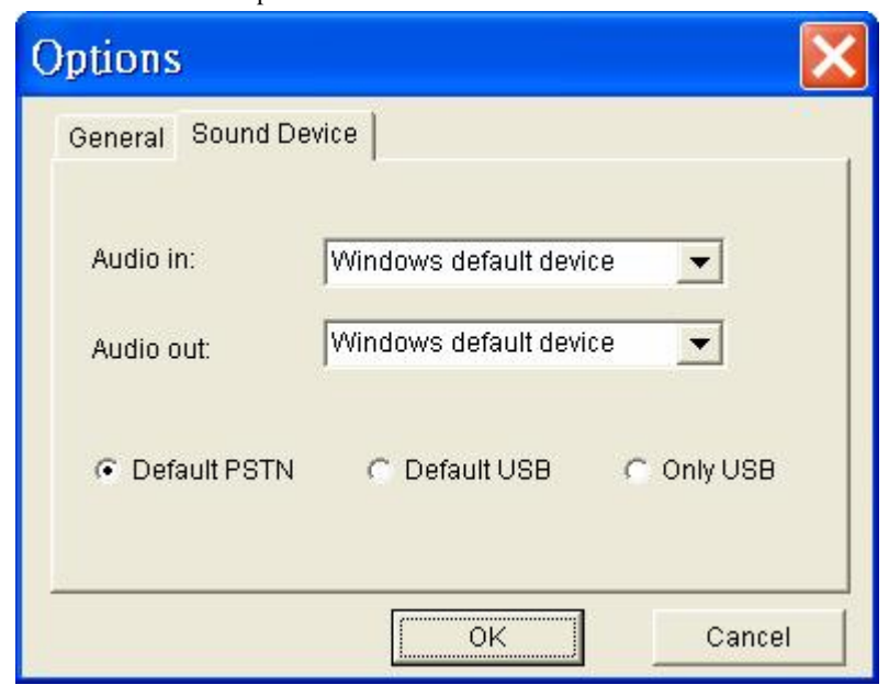
User's Manual ---- PeerCall ^{TM} USB Adapter